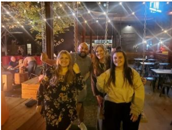
Saint Louis University staff at MASFAA conference in Columbus.